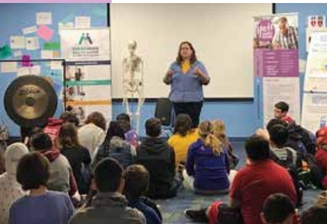
South Shore Public Charter School Presentation.