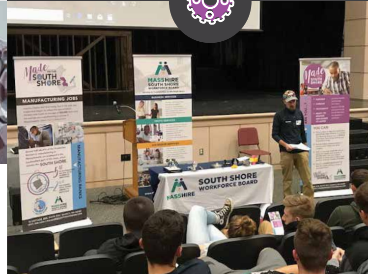
Presentation at Silver Lake Regional High School.

The MassHire South Shore Manufacturing Advisory Group kicked off its new campaign to promote the Manufacturing Industry sector in October 2018 by hosting numerous events and programs across the region. Presentations for high school and middle school students were designed to promote the career pathway opportunities within the Manufacturing Industry.