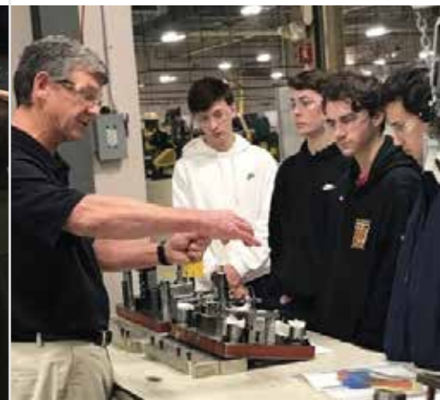
Weymouth Students visit Electroswitch facility in Rockland.