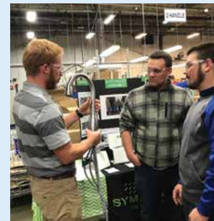
Quincy High School Students visit Symmons Industries in Braintree.

Quincy Public Schools, Rockland Public Schools, Silver Lake Regional High School, South Shore Vocational Technical High School, South Shore Public Charter School, and Weymouth Public Schools. More in-school presentations are being planned with Braintree, Middleborough, Plymouth and Randolph Public Schools.