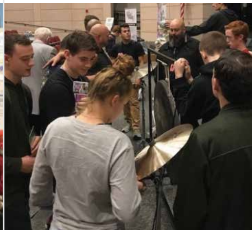
South Shore Vocational Technical High School Presentation.